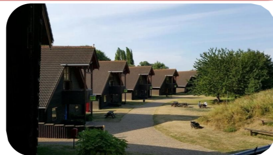
YHA Lee Valley