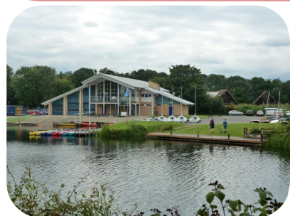
Herts Young Mariners Base

'Parents Information and Guidance' will be sent out if your child is offered a place